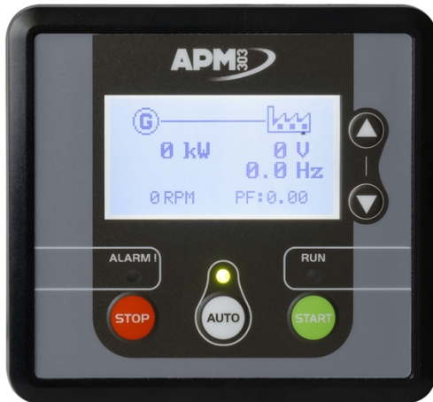
APM303, comprehensive and simple

The APM303 is a versatile unit which can be operated in manual or automatic mode. It offers the following features: